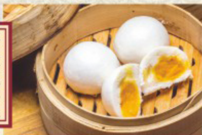
Steamed or Deep Fried Cream Custard Buns £6.20