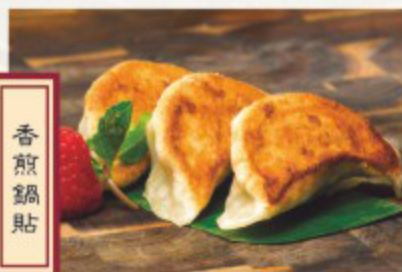
Grilled Handmade Gyozas £6.70