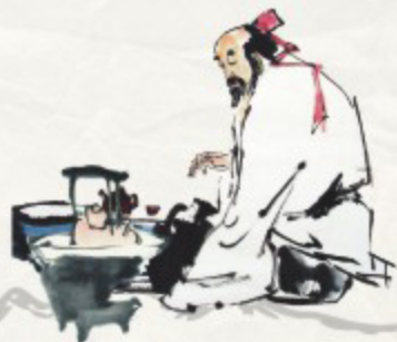
Photo illustrations are for reference only. All prices are inclusive of VAT. A discretionary service charge of 12.5% will be added to your bill.