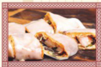
腐皮蝦腸粉 Crispy Beancurd Skin Prawn Cheong Fun £8.50