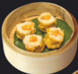
干蒸燒賣 Pork and Prawns Siu Mai £6.70