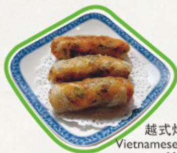
越式炸春卷 Vietnamese Spring Roll £6.70

Photo illustrations are for reference only. All prices are inclusive of VAT. A discretionary service charge of 12.5% will be added to your bill.