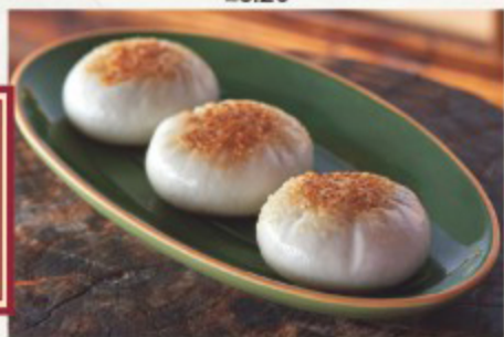
Pan-fried Pork & Vegetables Buns £6.70