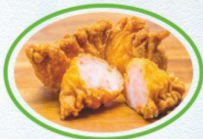
沙律明蝦角 Deep Fried Prawn Dumplings with Salad Dressing £6.80