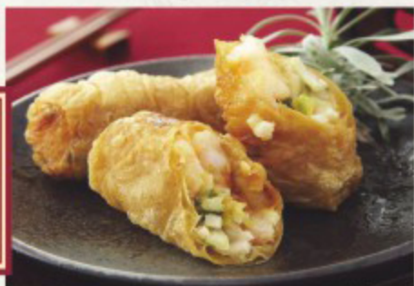
Crispy Beancurd Skin Prawn Rolls £6.80