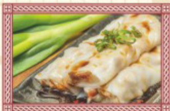
叉燒腸粉 BBQ Pork Cheong Fun £7.20