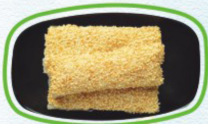
威化紙包蝦 Deep Fried Sesame Prawn Rolls £6.80