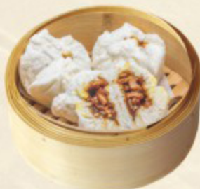
蠔皇叉燒包 Steamed BBQ Roast Pork Buns £6.20