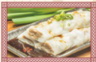
牛肉腸粉 Beef Cheong Fun £7.20