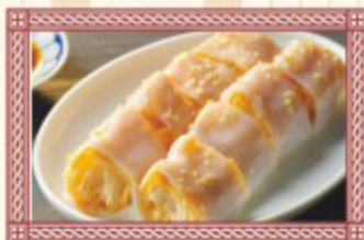
蔥花炸兩 Deep Fried Dough Cheong Fun (V) £7.20