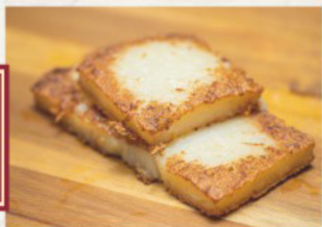
Grilled Turnip Cakes £6.20