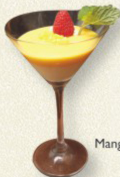
Mango Pudding £6.70