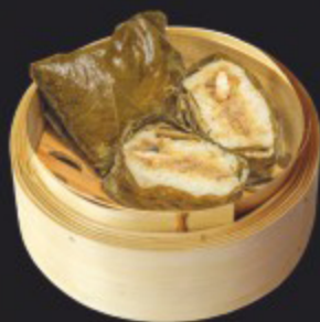
八珍糯米雞 Glutinous Chicken Rice in Lotus Leaves £6.80