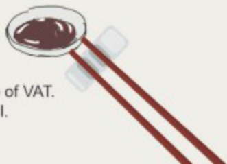
Photo illustrations are for reference only. All prices are inclusive of VAT. A discretionary service charge of 12.5% will be added to your bill.