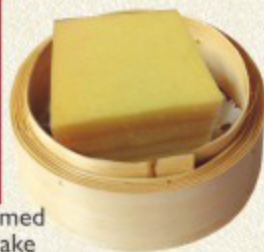
Malay Steamed Sponge Cake £7.00