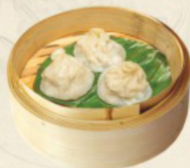
上海小籠包 Steamed Pork Dumplings Shanghai Style £6.70