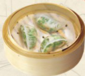
鮮蝦韭菜餃 Prawn and Chives Dumplings £6.80