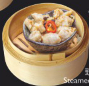
豉汁蒸排骨 Steamed Pork Spare Ribs in Black Bean Sauce £6.20