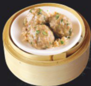
山竹牛肉球 Beef Meat Balls with Beancurd Skin £6.80