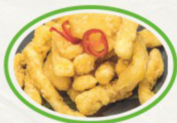
酥炸鮮魷 Crispy Fried Shredded Squid £7.80