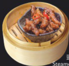
豉汁蒸鳳爪 Steamed Chicken Feet in Black Bean Sauce £6.70