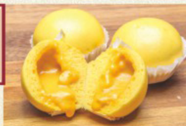
Flowing Custard with Salted Egg Yolk Buns £6.80