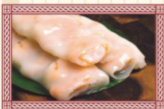
鮮蝦腸粉 Prawn Cheong Fun £8.20