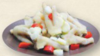
女兒紅鳳爪 Chicken Feet Marinated with Rice Wine £6.80