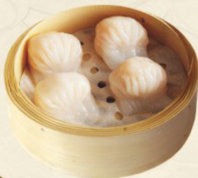
晶瑩蝦餃 Crystal Prawn Dumplings £6.80