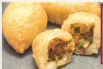
Fried Glutinous Rice Dumplings £6.70