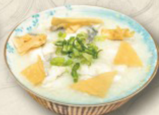
生滾魚片粥 Congee with Sliced Fish Fillet £10.50