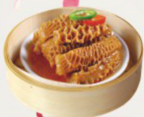
沙爹金錢肚 Steamed Beef Tripe in Satay Sauce £6.70