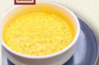
Fresh Mango and Grapefruit Tapioca £6.80