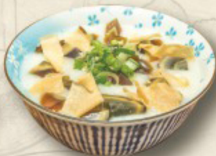
皮蛋瘦肉粥 Congee with Shredded Pork and Century Egg £9.60