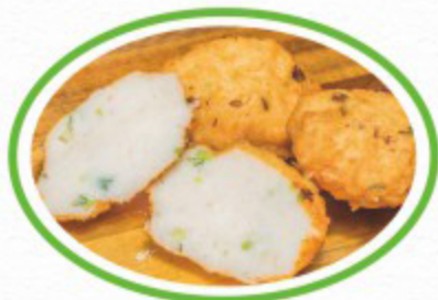
香茜墨魚餅 Fried Squid Cake £6.80