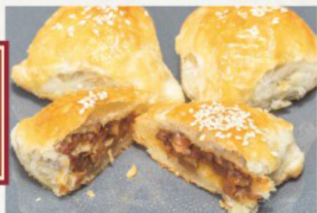
Honey Roasted Pork Puffs £6.20