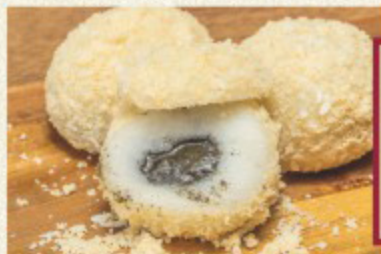
Black Sesame Glutinous Rice Balls £6.80