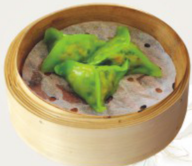
鮮蝦菠菜餃 Steamed Spinach and Prawn Dumplings £6.80