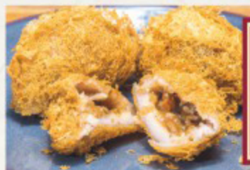
Fried Yam Paste Meat Dumplings £6.80