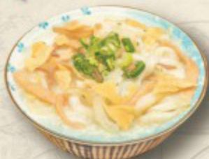
咸蛋鴨絲粥 Congee with Shredded Duck & Salted Egg £9.60