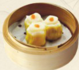
鮮蝦帶子燒賣 Scallop and Prawn Siu Mai £6.80