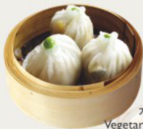
水晶羅漢餃 Vegetarian Dumplings (V) £6.70