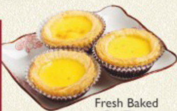
Fresh Baked Egg Tarts £6.00