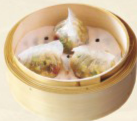
潮州粉果 Steamed Pork & Radish Dumplings £6.80

Photo illustrations are for reference only. All prices are inclusive of VAT. A discretionary service charge of 12.5% will be added to your bill.