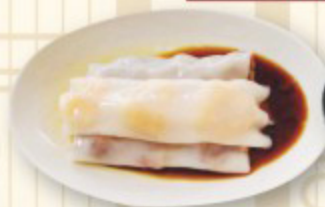
三式腸粉 Mixed Cheong Fun £8.20