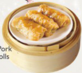
蠔皇鮮竹卷 Stuffed Prawn & Pork Beancurd Skin Rolls £6.80