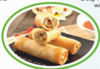
五香春卷 Deep Fried Prawn & Pork Spring Rolls £6.80