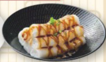
港式碎仔腸 Plain Cheong Fun with Peanut Sauce (V) £7.20